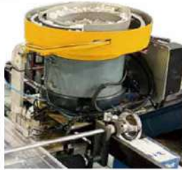
AUTO SLIDER INSERTING DEVICE