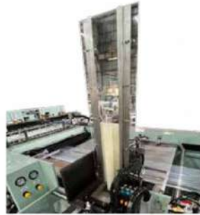
PLASTIC HANGER DEVICE