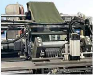
OUTER POCKET DEVICE