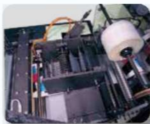
patch film sealing unit