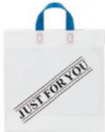
LOOP HANDLE BAG