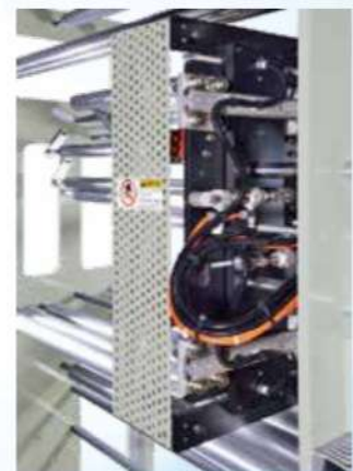
連續封口(封頂摺用) Continuous sealers for top gussets